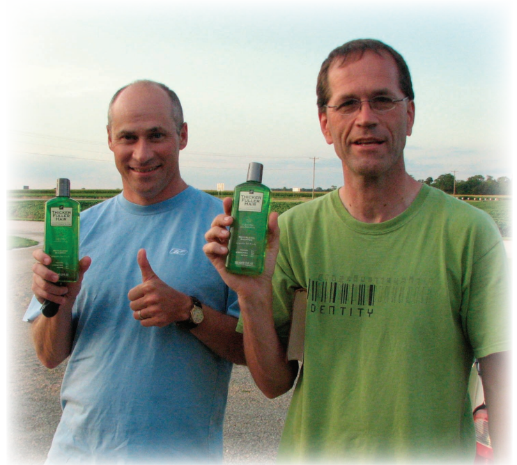
Thicker Fuller Hair: Part of the new marketing strategy to improve the church's image in the community.

Next year's conference will be on the campus of Cedarville University near Xenia, Ohio. Put the date on your calendar to join in as CMC celebrates 100 Years of God's Faithfulness July 29-August 1, 2010.